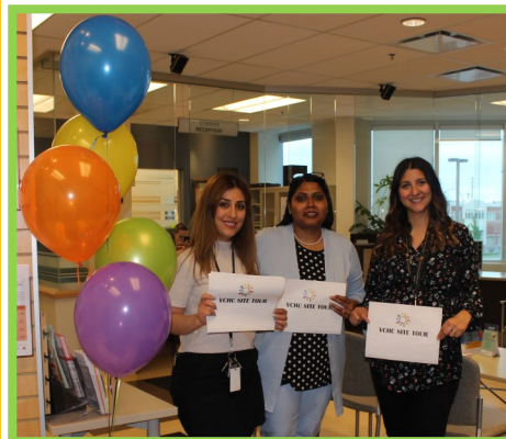
Diabetes Team providing tours of VCHC clinical and COPD

It seems like only yesterday boxes were being unpacked in the official site for the Vaughan Community Health Centre (VCHC), however, time