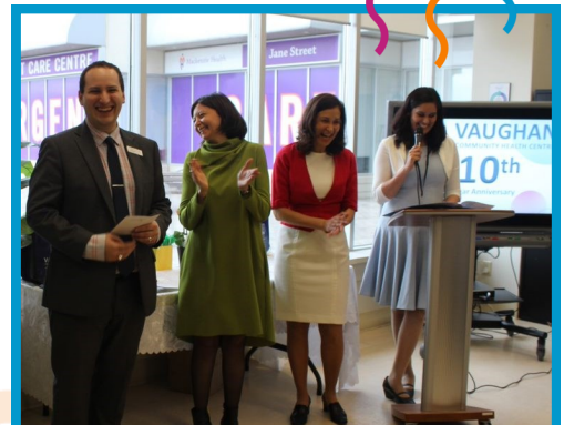
Board members, Executive Director and our HR Generalist celebrating our 10 year milestone