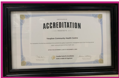
VCHC Certificate of Accreditation

A big thank you goes to the VCHC volunteers, students, clients, and staff that diligently worked in preparing the VCHC for this review.