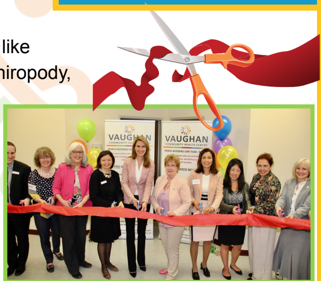
Officially cutting the ribbon to the VCHC Keswick Site!